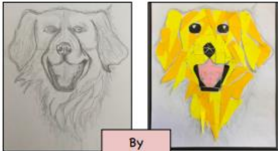
By Vinn and Braith

Whanau 6 is so amazing Whanau 6 is always blazing Work is always done We leave out no one Whanau 6 is so amazing By Tasi and Samantha Room 6 doing lots of learning Most kids shouldn't be concerning Kids having lots of fun Eating hot cross buns Finished P.E and returning By Stephen and Braith